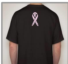
BACK (PG Falcon Ribbon Top middle on all shirts)